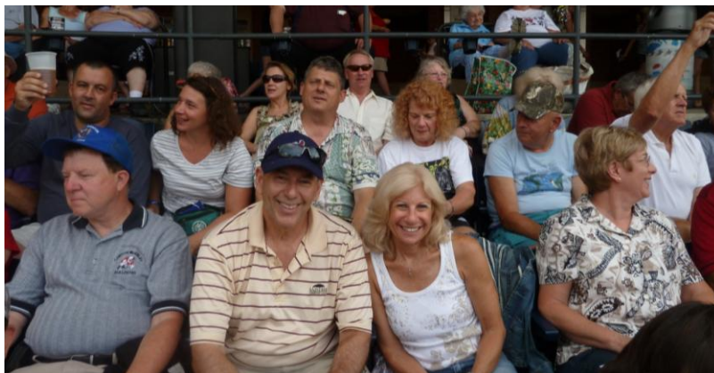
Some of the gang at the July 29 th Akron Aeros game

Come visit us at our next business meeting, Tuesday, August 8 th . Meeting is held at the Akron Turner Club, starting at 7:30 PM.